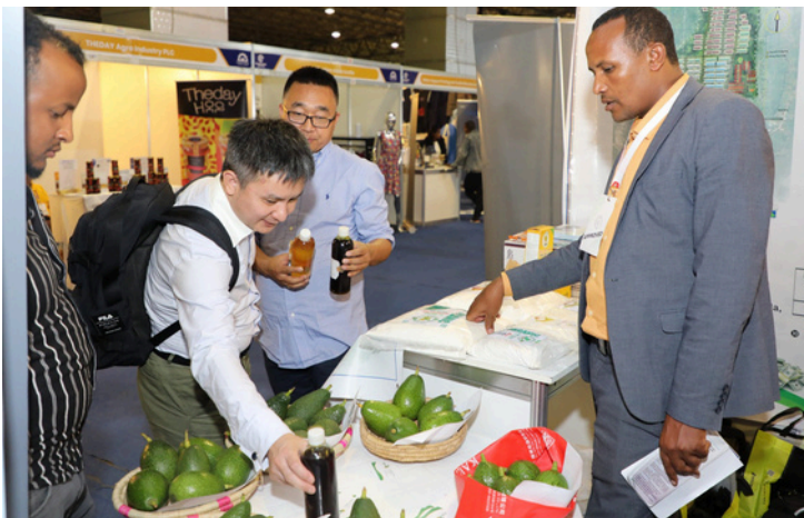
Yirgalem IAIP showcasing their product to visitors

Visitors are showing interest in processed products like honey, avocado oil, and flavored milks produced by different companies in the park, aiming to establish market connections and attract new investors.