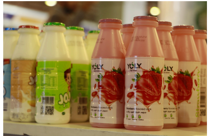
Processed milk product by Douley Milk processing company from Yirgalem IAIP

Prime Minister Abiy Ahmed (Dr.) inaugurated the expo. The products from Integrated Agro Industry Parks, investment opportunities, and overall activities are being actively promoted to local and international visitors.