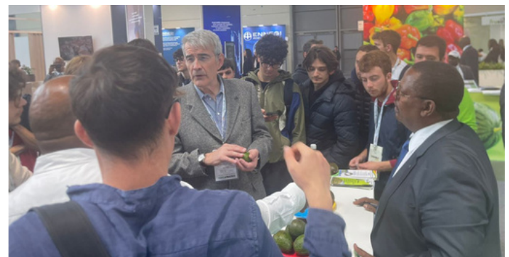
YBM Manufacturing PLC having a visitors at the expo,