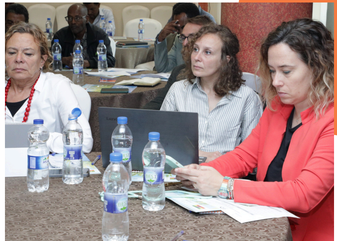
ART-ER team consultants at the meeting.

Moving forward, the consultant firm Art-ER, in collaboration with UNIDO, is expected to provide support in governance, legal frameworks, laboratory enhancements, and coordination during their remaining time in the country. Their expertise will be crucial in navigating the intricacies of food safety.