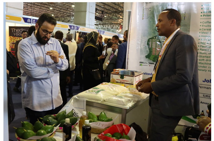
A foreign investor curious about opportunities in the park.