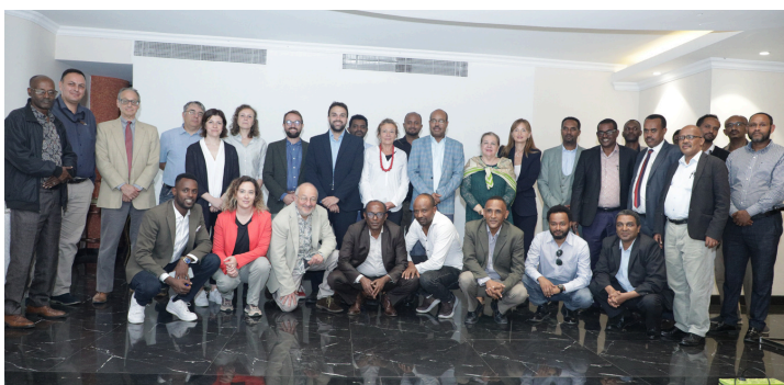
Group Picture of Meeting participants

The workshop concluded with a commitment to ongoing collaboration, knowledge exchange, and the adoption of best practices in traceability. Stakeholders acknowledged that traceability is not only a regulatory necessity but also a pathway to establishing safer and more sustainable food systems as the industry progresses.