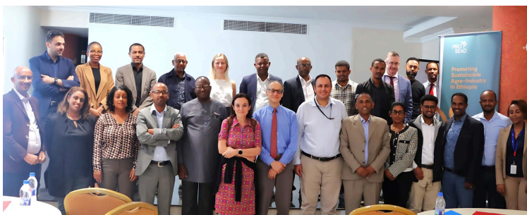
Group Picture of Meeting participants

During the meeting, key topics such as infrastructure development, market linkages for smallholder farmers, access to finance, skills development, food safety, governance, and coordination were discussed. Some highlights from the presentations include: