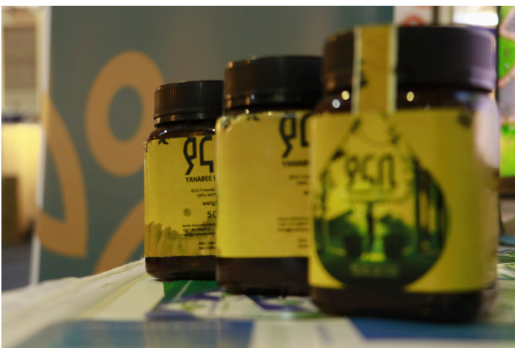
Processed honey product by Shecka Nordic honey processing company from Bulbula IAIP

The EU-funded PROSEAD (Promoting Sustainable Agro-Industry in Ethiopia) project and the AfDB-funded Integrated Agro Industrial Parks-Support Project (IAIP-SP) provided support for the initiative.